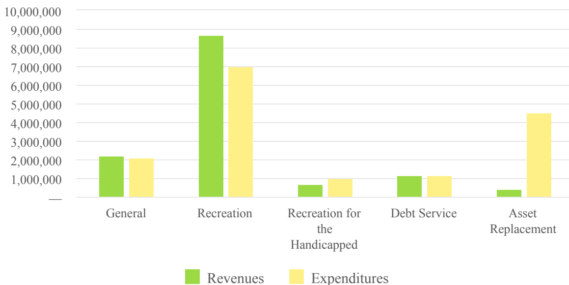
Fund Level Revenues and Expenditures

See below for a chart which shows by fund a visual representation of revenues and expenditures.