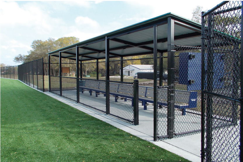
DUGOUT WITH ROOF