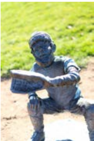
Village Green Park