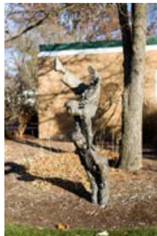
Spring Avenue Rec. Center