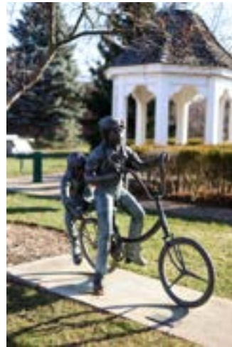
Prairie Path Park