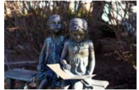
Spring Avenue Rec. Center