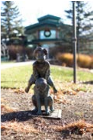
Spring Avenue Rec. Center